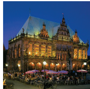
City of Bremen: The Town-Hall World Heritage Site

e-mail: mscbmb@uni-bremen.de or visit our web site www.uni-bremen.de/mscbmb www.uni-bremen.de