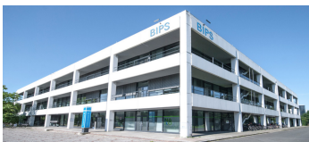
© Leibniz-Institut für Präventionsforschung und Epidemiologie - BIPS