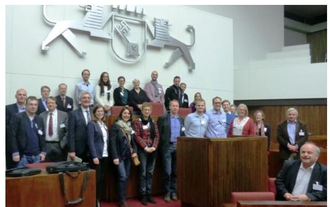
Alumni at the Bürgerschaft of Bremen

You can find information on upcoming events in the „Networking from, for and with alumni“ HERE .