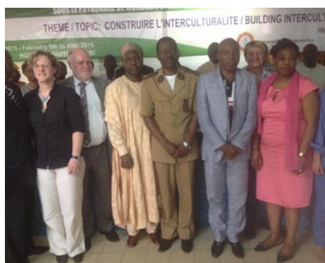
Participants of interculturalism workshop in Cameroon

After two days of intense discussion, a number of new ideas for collaboration were on the agenda, spanning from joint research projects through to student exchanges and which will enrich cooperation between the universities.