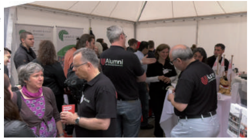
The alumni-pagoda.

It was a fascinating event that will again draw in a crowd of thousands in 2019. /MB