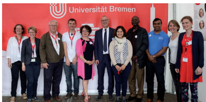
Research Ambassadors, rector and International Office during Open Campus 2017.

For the first time, several Research Ambassadors came together for a joint workshop in Bremen on June 15 and 16, 2017. Aim of