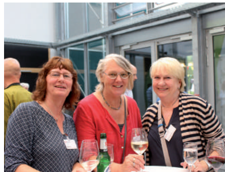
Time for conversations at the traditional get-together.