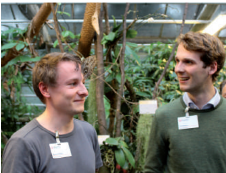
This alumni was well liked by the butterflies.

Impressions of the educational work of the botanika's 'Green School' and the multifaceted partnership with the university, with associations, and businesses in the botanika's 'Green Forum', and the ensuing tour gave us an exclusive look behind the scenes. The traditional get-together with drinks and finger food was held in the special atmosphere of the park. The lively conversations of the alumni attested to the great interest and the fun of exchanging ideas and encountering others. /MB