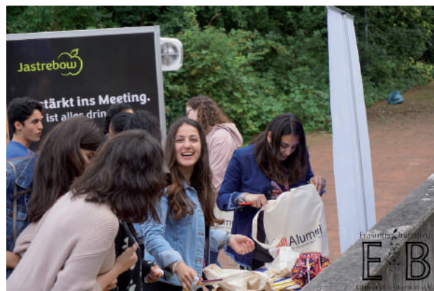
International students with the „Alumni“ tote bags.

The farewell barbecue also gave the International Office an opportunity to say goodbye to the students and to invite them to become alumni of the University of Bremen. The 'Alumni' tote bags were a major hit! We are now looking forward to welcoming many new international members to the alumni association!