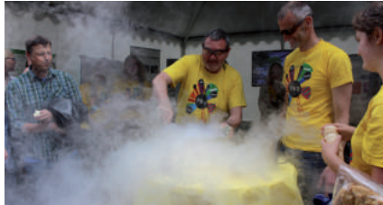
Selfmade ice cream at faculty 3.

It has been a tradition since 2013 that the University of Bremen opens its doors biannually at the Open Campus event. To whom? To students and those interested in studying as well as all citizens – simply to everybody. The departments, institutes, and service providers of the university present themselves and their accomplishments to the public. Attractive sciences – challenging research – interesting projects and open doors for first insights. Visitors were able to stop by the various stage shows and versatile presentations and wondered in awe. Interesting information and incredible