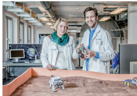
In the DLR_School_Lab.

When the IAC opens on October 1, 2018, a top-level opening ceremony is planned for all guests, among them not only the German Chancellor and the Director General of ESA but also the Chair of the German Aerospace Center (DLR) as well as representatives of other space agencies (NASA, JAXA, etc.). The world as a guest in Bremen! The DLR, OHB SE, MT Ae-