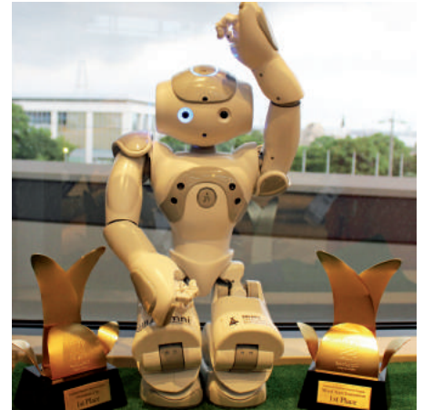
B-Human robot with trophies.

also about penalty kicks this year. By means of a knockout-tournament, the winner was determined in five rounds from 24 teams. In it, only two robots managed to score once against the strong Bremen goalie. Additionally, all B-Human kickers were successful in their attempts to score, so no team was able to prevent the Bremen team from winning.