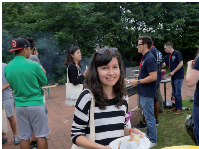
Farewell barbecue and anniversary of the Erasmus program in one.

More than 200 international students from our partner universi-