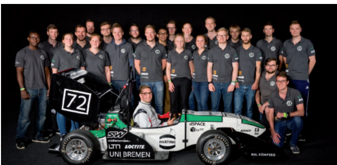
The Bremery-Team.

NOTICE: The number of participants is limited to forty people. Participation is free of charge. Please register here .