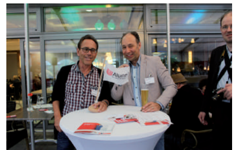
Getting to know each other.