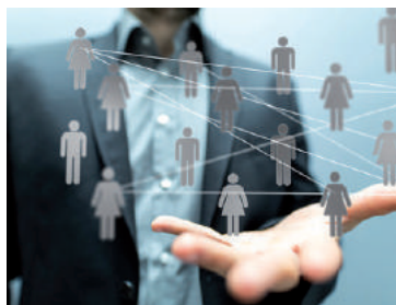
Networking - how exactly does it work?

Everyone is talking about it – but how exactly does it work? In a new 'Career Prospects with Alumni' seminar, taking place on Saturday, October 28, 2017 (10 a.m. to 5 p.m.) , we are given the opportunity to face that question. The group of participants will work out together in which networks they are already active – knowingly or unknowingly.