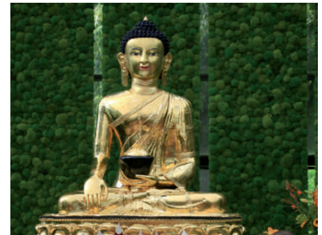
The Peace Buddha statue.