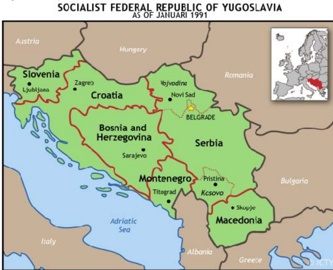
Figure 1. Map of the former SFRY 2

Serbian housing system and policy as such, similar to other former Yugoslav republics, has its roots in the beginning of the twentieth century. Until 1953, the main role in managing housing policy was centralized and assigned to the Federation. In 1953 the process of decentralization changed the role of the Federation and transferred it to the republics and municipalities. 3 The new approach eradicated state monopoly and founded specific non-state institutions (social-political communities). This model of social self-governance established the institute of social ownership that became the prevailing form of tenure in Yugoslavia. The social property was owned by all citizens of the Yugoslav society. In addition, the society transferred the right of disposal with the socially owned property to Yugoslavia. The social ownership was comparable to “the common good” of all Yugoslav citizens. The institutions that were in charge of acquiring and allocating dwellings to tenants were enterprises, the Self-Managing Interest Communities for Housing ( Samoupravno Interesno Stambeno Udruženje ), municipalities and different state agencies. 4