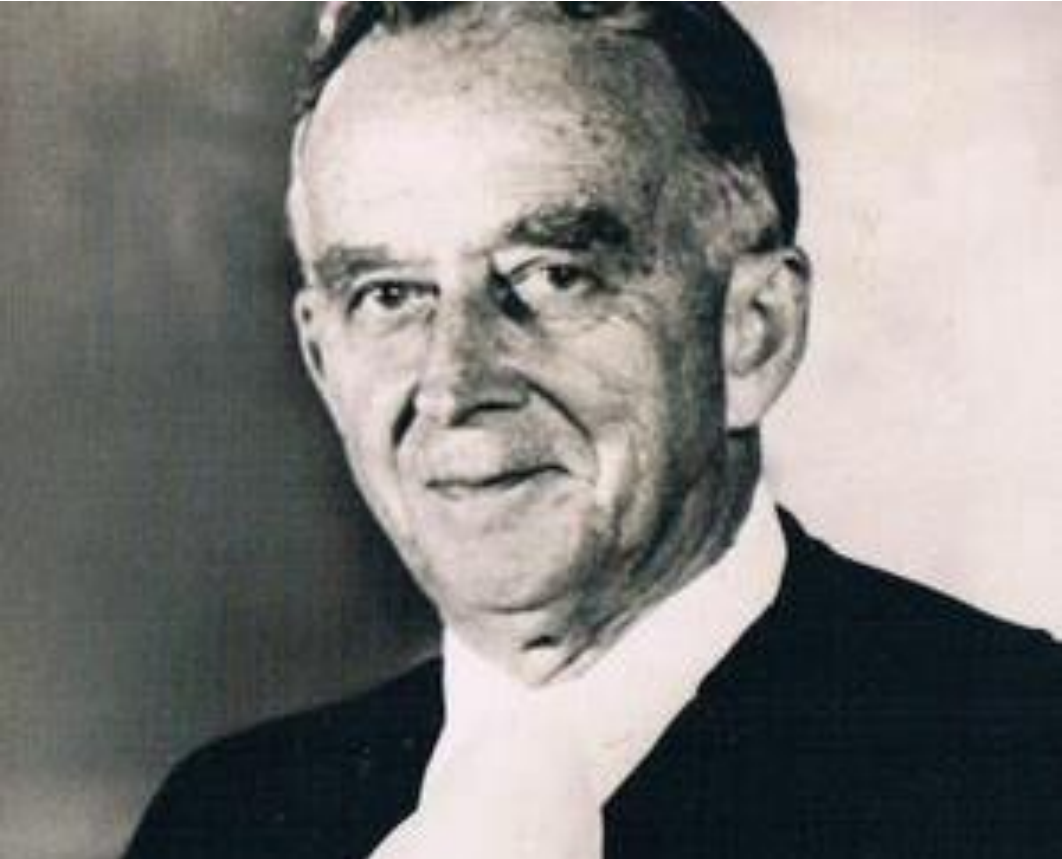
Philip C. Jessup (1897–1986)