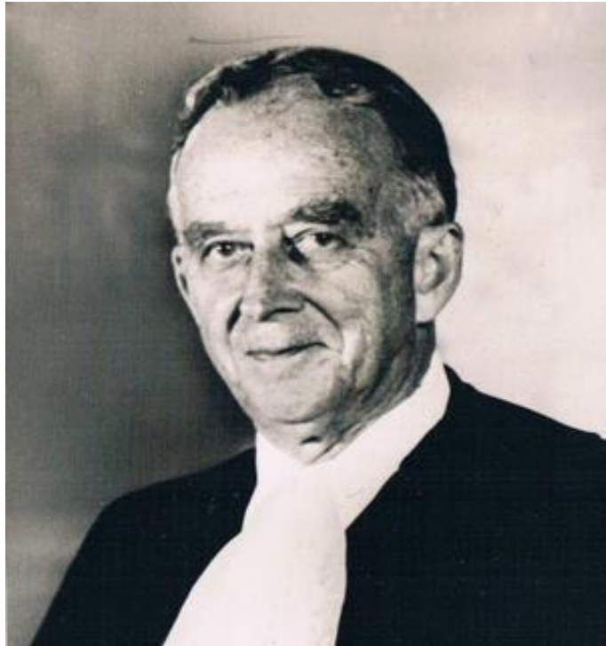
Philip C. Jessup (1897–1986)