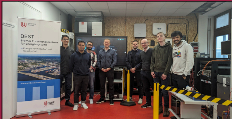
BEST @ IAT Future Electricity Networks