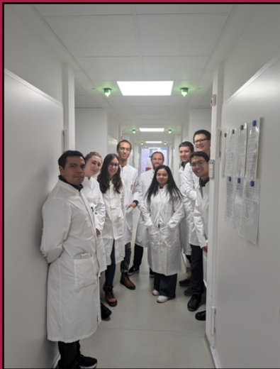
BEST @ Umweltverfahrenstechnik