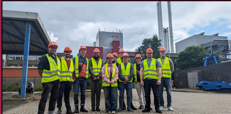
BEST @ Müllheizkraftwerk Bremen