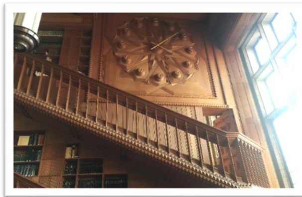
Photo 1. Clock in the central library

The atmosphere in campus is quite friendly and keen. I joined two student unions. One is Pangaea. It is established by KUL but organized by both university and students. They have their own building on the campus social science. There you can get free coffee and tea as long as you are a member of them. They organize many social activities for international students, including weekend trip, language night, and non-academic seminars.