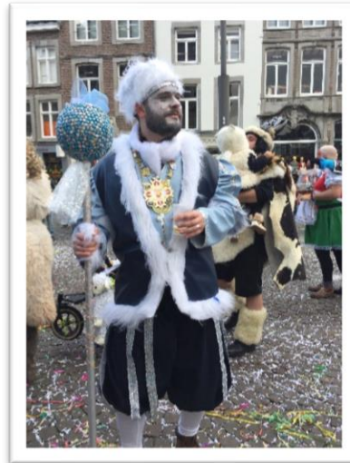
Photo 2. Canaval in Maastricht with ESN