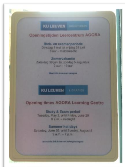
Photo 4. Exam period

It is not easy to get a high grade in both written exam and paper, therefore you will find all libraries are full during the exam month.