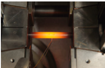
Fig.1: Thermal and mechanical testing of a 100Cr6 test specimen inside the Gleeble 3500.

The Gleeble 3500 simulates high temperature forming processes for metals like forging, welding or annealing. At its core, the device is a servohydraulic dilatometer for metallic materials with conductive heating at a maximum rate of 10.000 K/s up to 1.200 °C. Heat treatments with various quenching speeds up to 2.000 K/s can be realized while detecting phase transformations or determining mechanical properties at high temperatures. Tension and compression can be